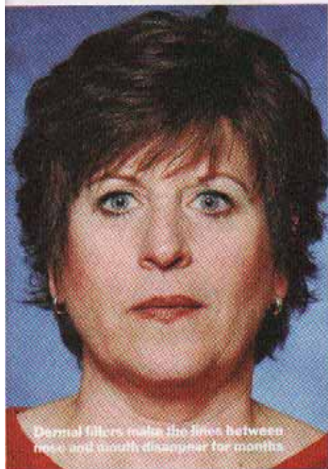
Dermal fillers make the lines between nose and mouth disappear for months