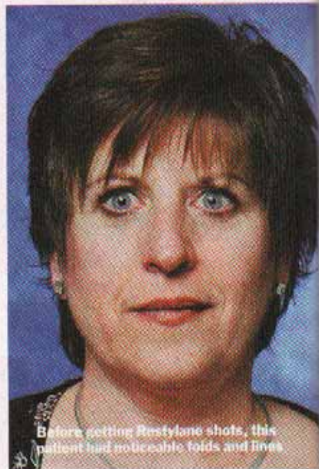
Before getting Restylane shots, this patient had noticeable folds and lines

a competitor before it's even out of the box: Restylane, the current best-selling hyaluronic-acid filler, made by Medicis, a $344 million dermatological company based in Scottsdale, Ariz. And Medicis' Perlane, a more robust version of Restylane, is expected to get the FDA's thumbs-up any day now. Down the road, there's a