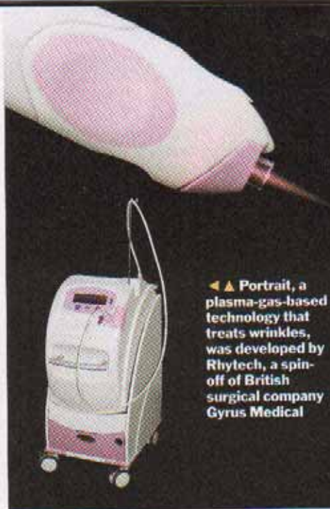
◀ ▲ Portrait, a plasma-gas-based technology that treats wrinkles, was developed by Rhytech, a spin-off of British surgical company Gyvus Medical

Even though the various treatments work slightly differently, they operate on a similar principle: they deliver heat energy to the skin's deeper layers, which essentially