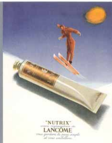
"NUTRIX" LANCÔME une grande de son temps et sans égal.

Launched in 1936, Lancôme's first skincare product remains a time-honoured remedy for razor burn, sunburn, windburn, nappy rash and cuts. In World War II, Nutrix Cream (with lashings of lanolin) was even used on burns victims in UK hospitals. The original cream, €52.50, is now joined by Nutrix Royal Fluid and Cream, €47 each, updated formulas with royal jelly and shea butter for very dry skin.