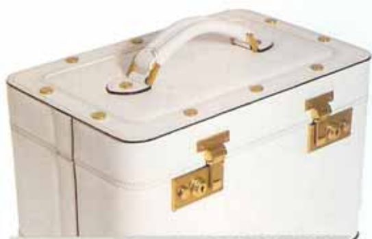
FIT FOR A QUEEN: WHITE LEATHER