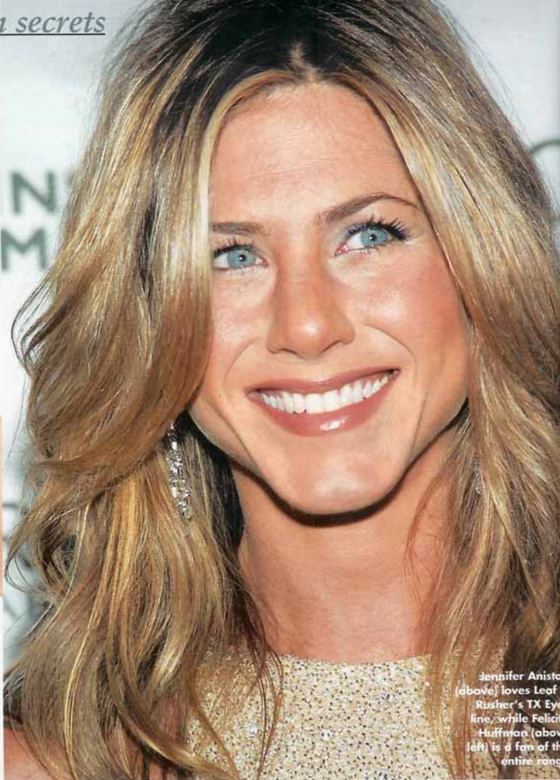
Jennifer Aniston (above) loves Leaf & Rusher's TX Eye line, while Felicity Huffman (above left) is a fan of the entire range

Two of Hollywood's top skincare experts recommend the stars' favourite non-surgical fixes — and hot new products to have you looking like an A-lister