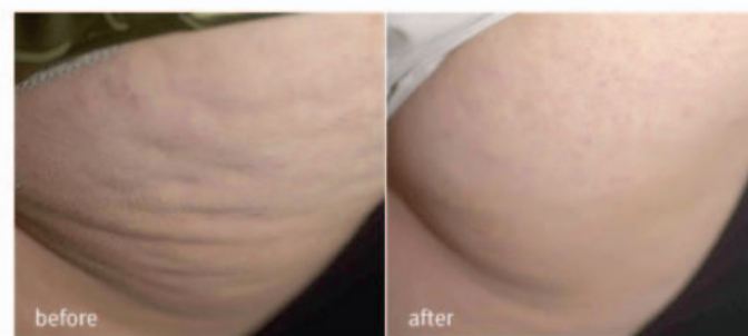
Cellulite Reduction After 8 Treatments