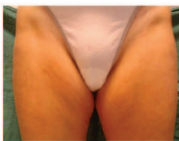
Inner Thigh Pre Mesotherapy Treatments